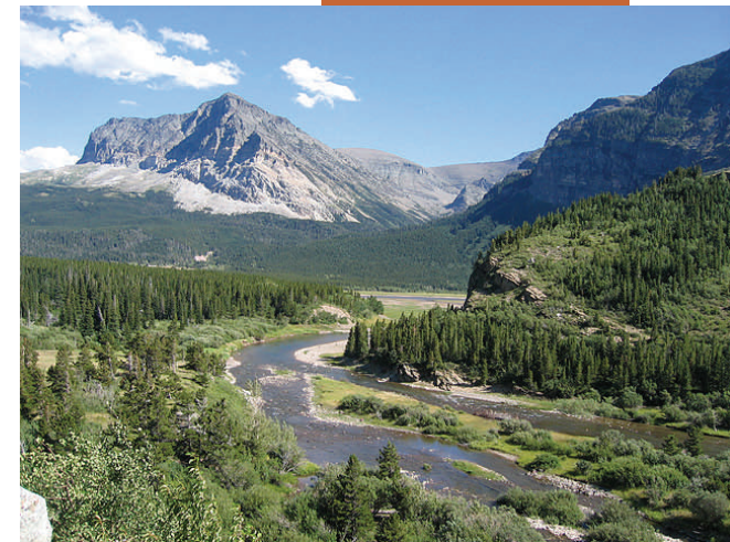
Ardis Dayrider, NPS Program Manager

Blackfeet Tribe's Clean Water Act Section 319 Non- Point Source Pollution Control Program