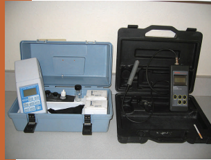
Monitoring and Sampling Equipment

Non-point source pollution occurs when rainfall, snowmelt, or irrigation runs over land and through the ground, picks up pollutants and deposits them in rivers, wetlands, and lakes and introduces them in ground water. NPS